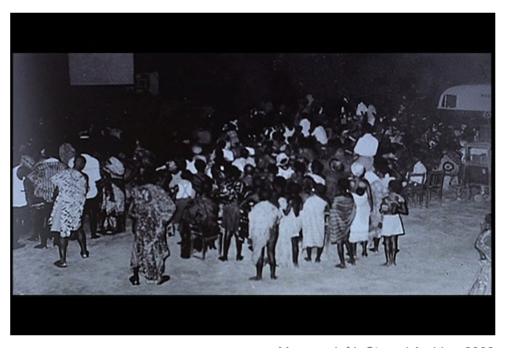
Maryam Jafri, Staged Archive , 2008. Video still.

MJ: My works often explore the interface between external systems of control and individual agency. But that interface works both ways; in other words, power flows both ways. Foucault was the first to note that power is productive, not simply negative; its effects can be felt in ways that are rational, even pleasurable, and there are always ways that power can be deformed, deployed in ways unforeseen or unintended, consciously or unconsciously. Put another way, to loosely quote Deleuze and Guattari, how or why do people seem to desire the very structures that imprison them, and how is that desire often felt in ways that are pleasurable, rational, inevitable or liberatory? And yet that doesn't mean we should be fatalistic; some structures are less oppressive than others and some struggles are more meaningful.