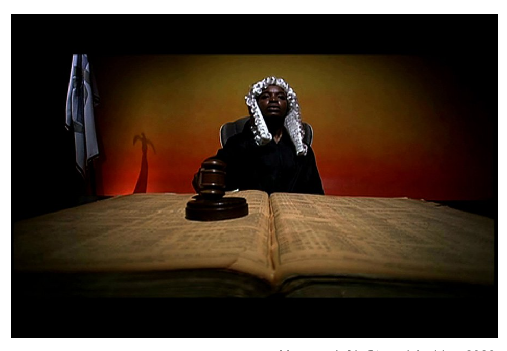
Maryam Jafri, Staged Archive , 2008. Video still.

more abstract forms of dealing with the archive that expand its space, rather than simply decoding its meaning. However, as noted earlier, I myself have employed contradictory approaches, depending on the source material, so the above statement is also contingent on the specific situation, the specific archive, or specific questions the artist wishes to address.